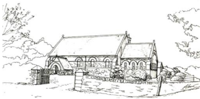
Holy Trinity Church, Crosshaven